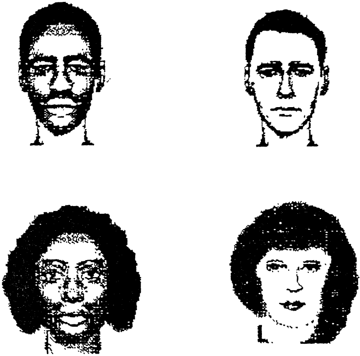
FIG. 1. Samples of schematic faces used as priming stimuli.

primes in the present study were immediately masked by geometrical figures, a "P" within an oval signifying a person or an "H" within a rectangle representing a house , occupying the same area. Geometrical figures were used as visual masks rather than letter strings (e.g., PPPPPP) in order to fully cover the area of the screen occupied by the facial primes. The cued category, which visually masked the facial or control prime, appeared on the screen for 250 ms. Then the test word (a positive or negative word or one of the six words that do not normally describe persons) was presented until the participant pressed the decision key, or up to 750 ms. There was a 1.5 s interval between trials.